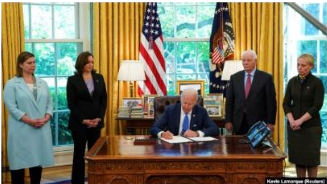
Washington, May 9, 2022. The U.S. President Joe Biden signs "The Law on Lend-Lease for the Defense of Democracy in Ukraine from 2022".

Dear Mr. President, on May 9, you solemnly, even pathetically, signed the law on Lend-Lease, which was promising for Ukrainians and was supposed to come into effect on October 1 (the beginning of the new fiscal year 2022-2023 in the USA).